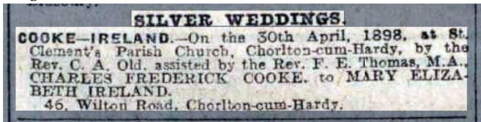
Image of the article